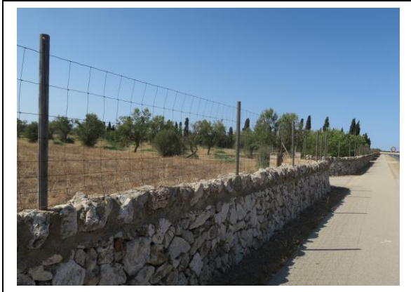
High flimsy fences

Some large fields are surrounded by high flimsy fences on top of stone walls where it will be impossible to lift balloons over. The gateway is usually filled by a tall gate padlocked with owners who live miles away and often absent. You are advised to avoid landing in these areas as you will be trapped. We hope to provide a crane to lift balloons out but it will cost.