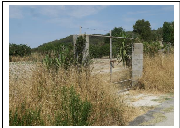
High flimsy gates