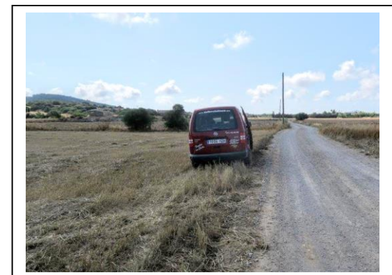
Park off the road like this