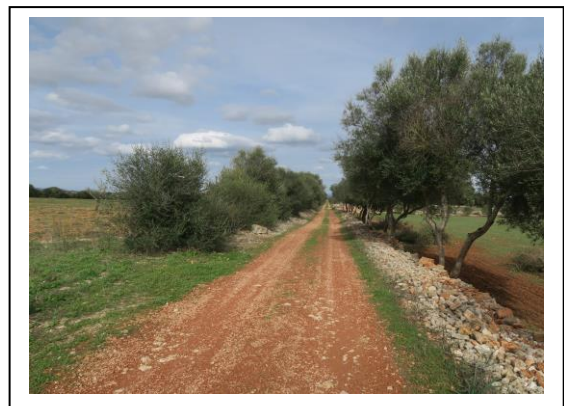
Difficult to pull to the side